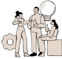
tips & tricks