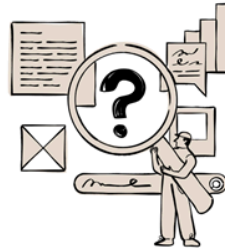
jobs & calls